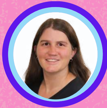
Acacia